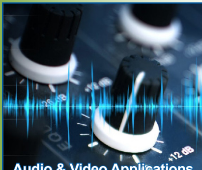
Audio & Video Applications