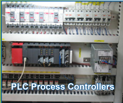
PLC Process Controllers